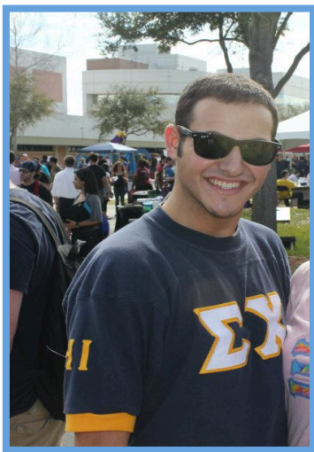
Eta Iota's 2012 Consul