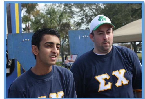
In the zone during the 2012 ERAU activities fair.